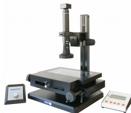
Micro Station with measurement table and large ST-500 stand